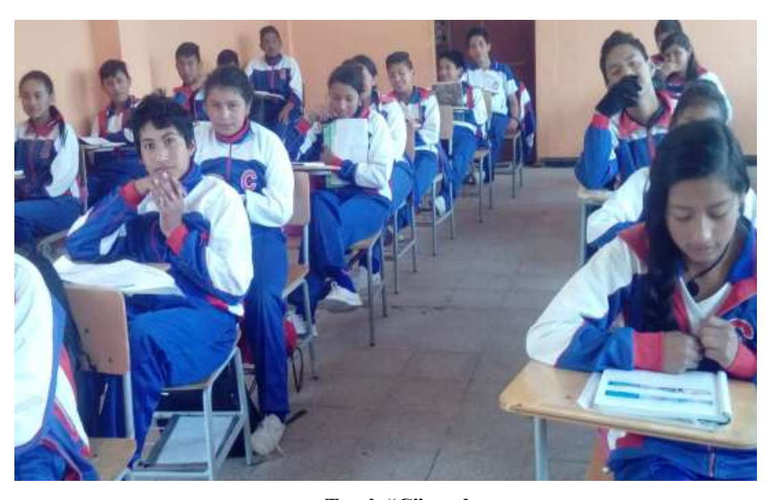
Tenth "C" students