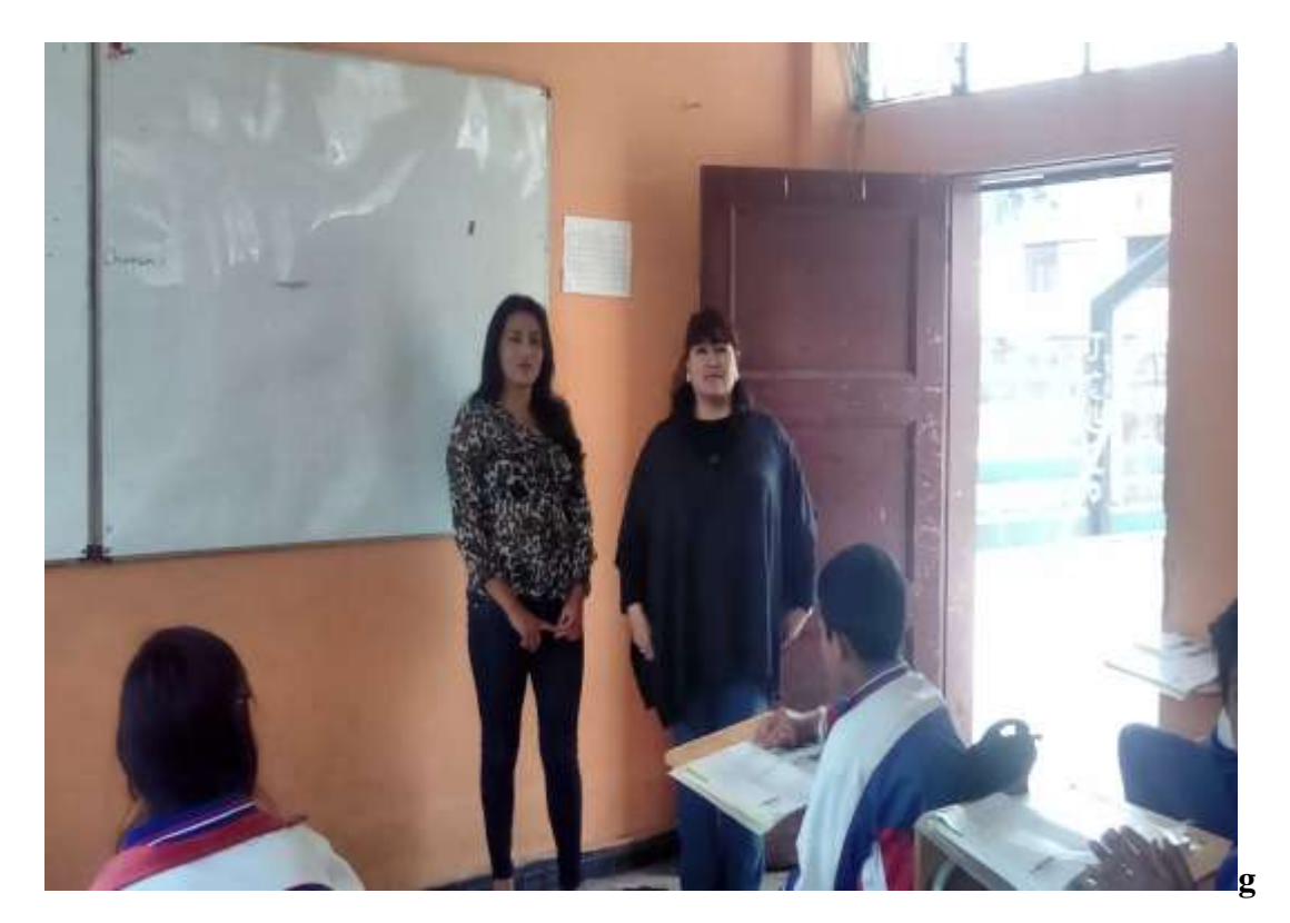
Tent "C" English teacher