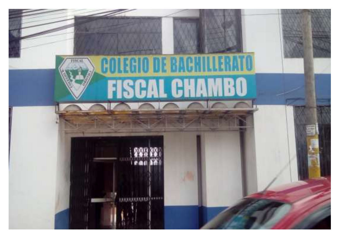
Chambo high school