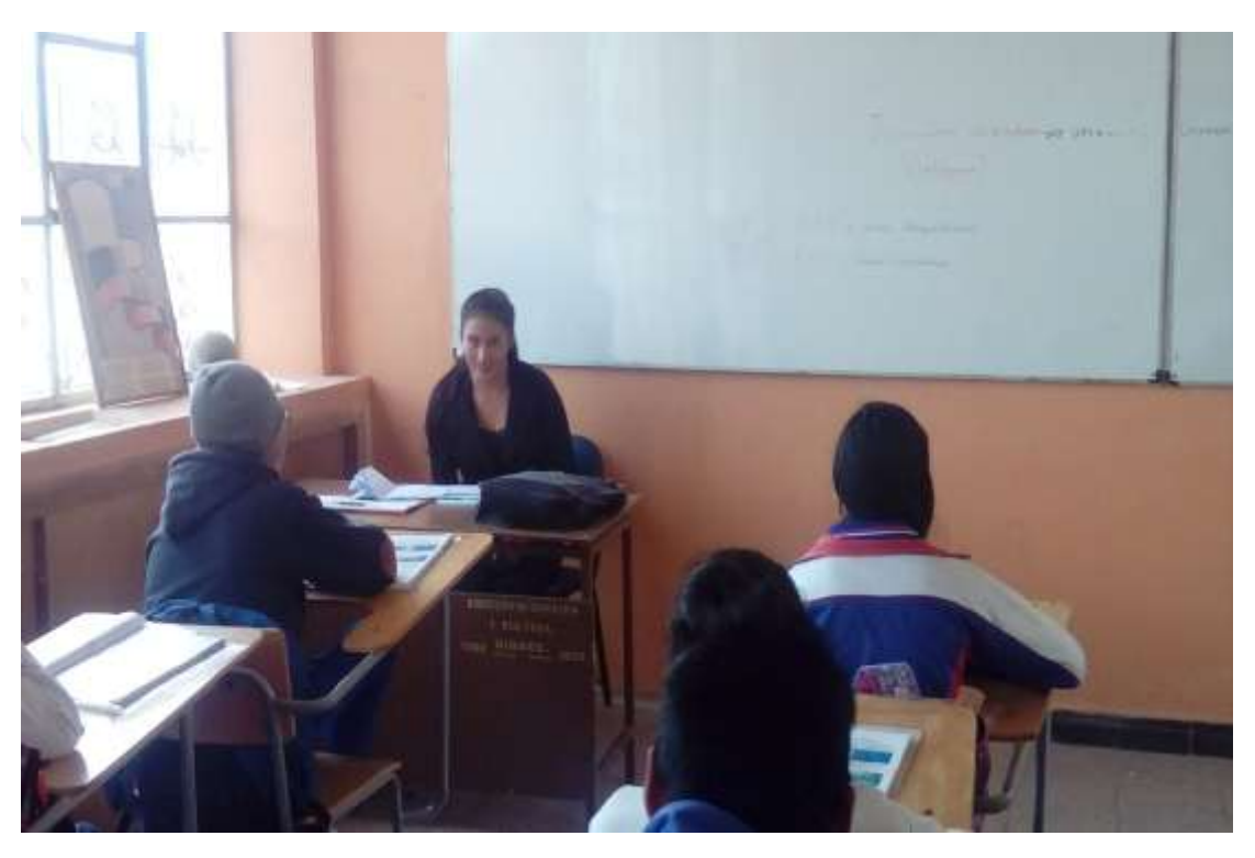
Investigator analyzing and describing observation