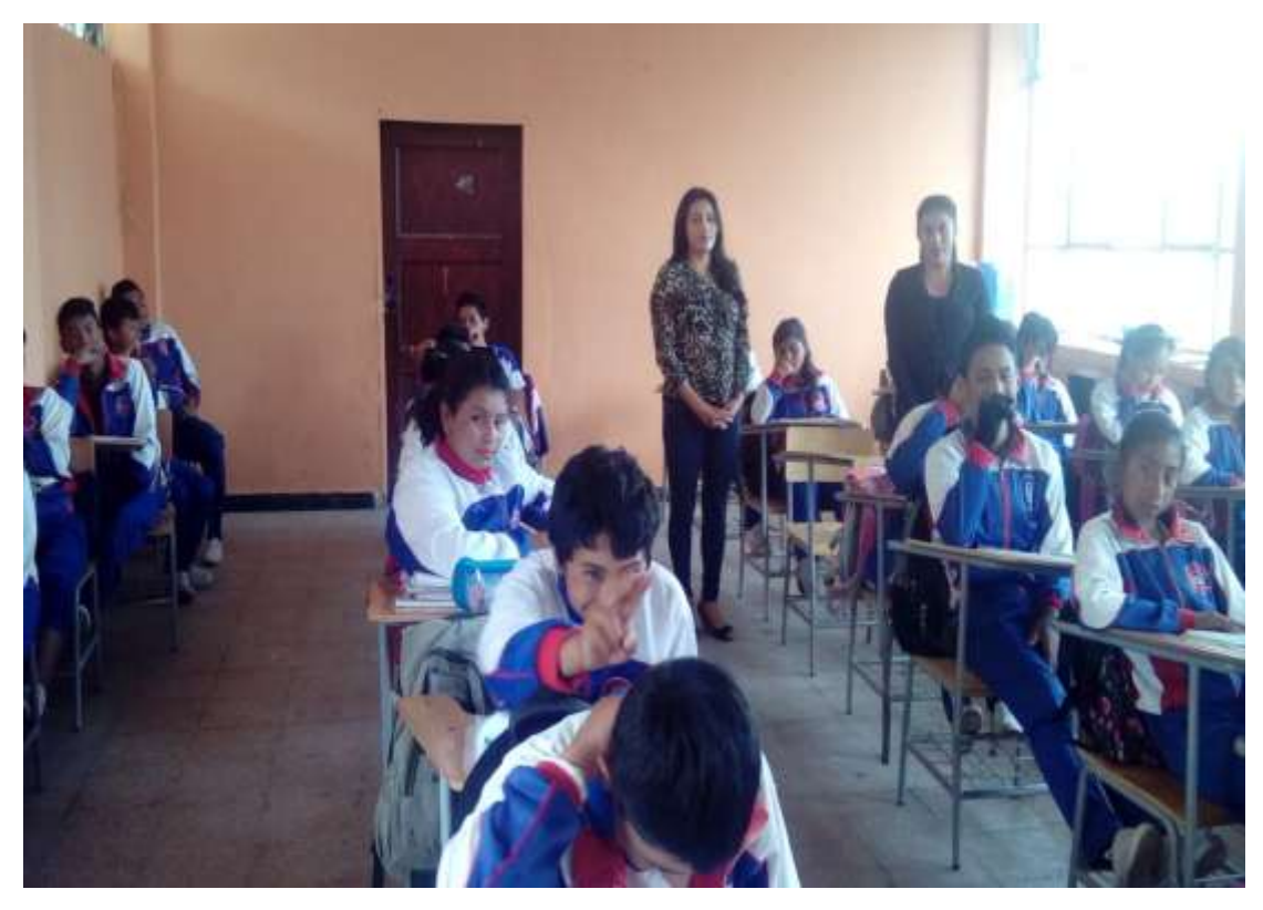
Investigators applying observation sheets at the moment to develop listening and speaking skills